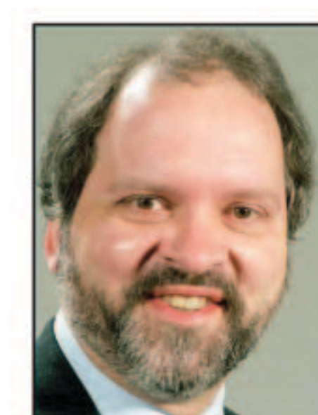
Prokopowicz: A blow to city and to Lincoln scholars