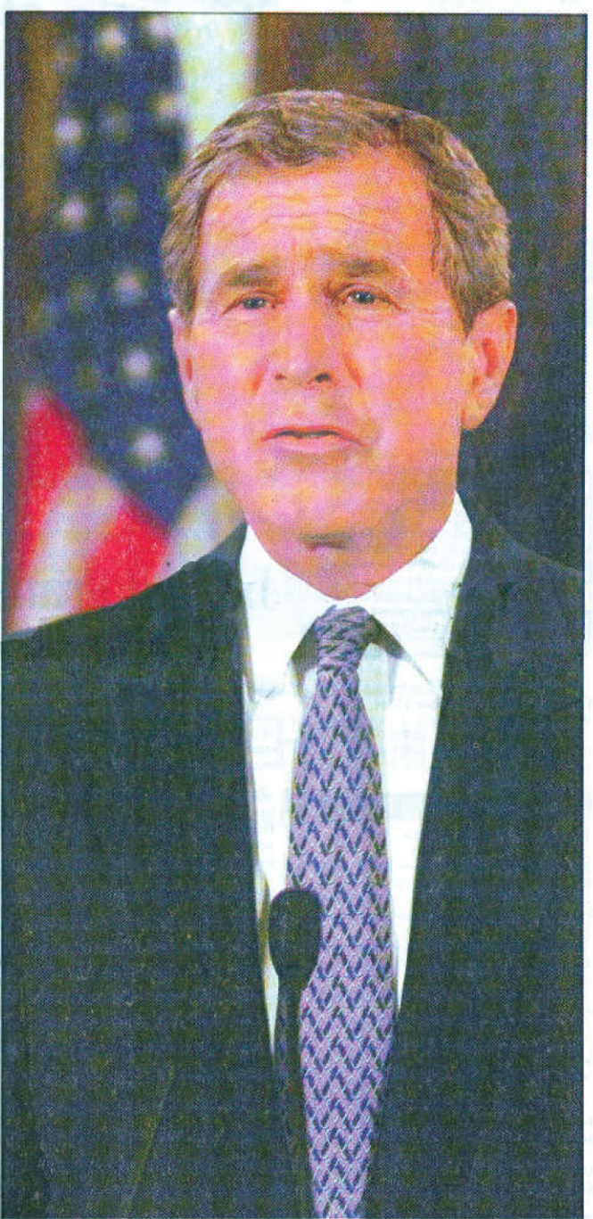
Republican presidential candidate Texas Gov. George W. Bush begins a televised address from his offices in Austin, Texas, on Sunday.

FOR UPDATES: Go to The News-Sentinel Web site at www.news-sentinel.com/ns